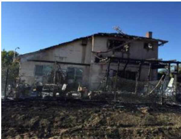
An Antioch home was damaged by a fire Saturday. (Contra Costa Fire)

Fire crews controlled that blaze in about 90 minutes, and many of the firefighters then were dispatched to fight a four-alarm fire in Antioch. Those remaining at the Brentwood scene needed another 6 1/2 hours to make sure the fire would not reignite, Henderson said.