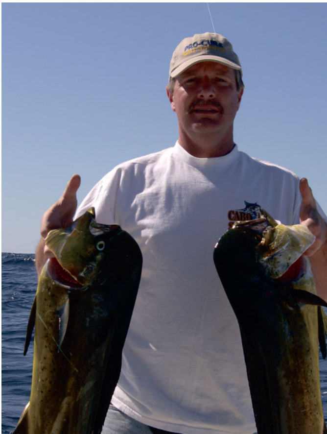
The Chief off duty in Cabo

"Every decision the guy has made has been the right one," he said.